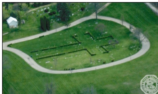
The Garden of the Cross

Obviously, the newsletter is a bit late this time around. We apologize for that, but we've been busy busy busy! And the wait was well timed, since the article below came out shortly after this issue SHOULD have, but it fits so much better in this issue than in the January one!