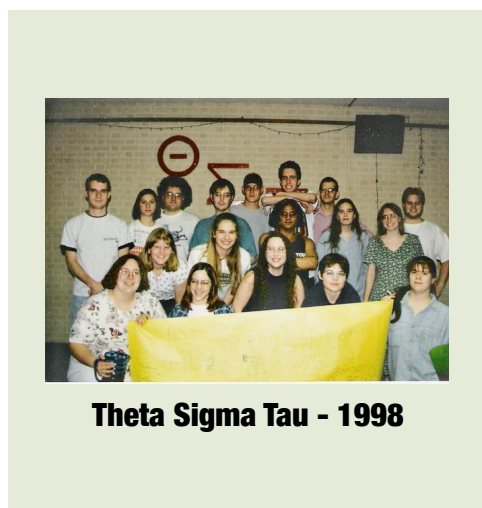
Theta Sigma Tau - 1998

See page two for a bit more chatter about the upgrades going on at the Tau website.